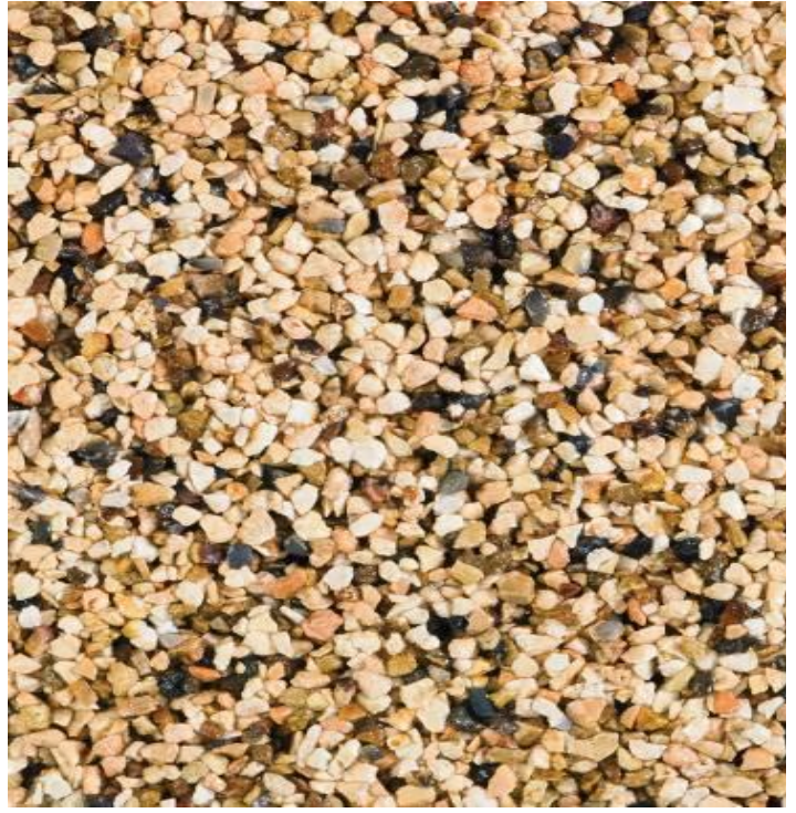
CHINESE BAUXITE BUFF HIGH PSV: +72 AVAILABLE IN 1-3MM & 0.9-1.2MM