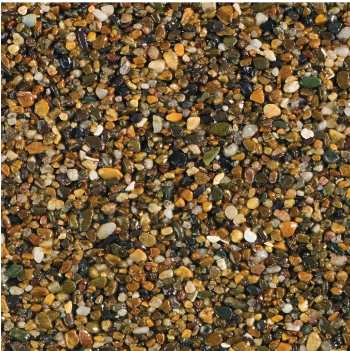
GOLDEN PEA PSV: 39 AVAILABLE IN 1-3MM