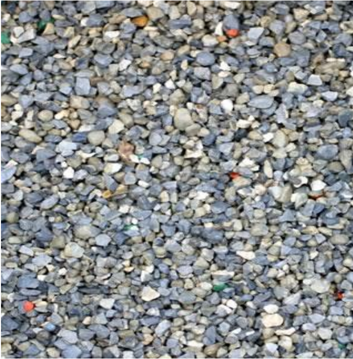
CHINESE BAUXITE GREY HIGH PSV: +72 AVAILABLE IN 1-3MM & 0.9-1.2MM