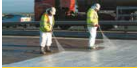
OUSE RIVER BRIDGE, YORK, UK

Eliminator is an advanced bridge deck waterproofing system with an unparalleled track record that will outlast your structure and provide you with reduced maintenance costs.