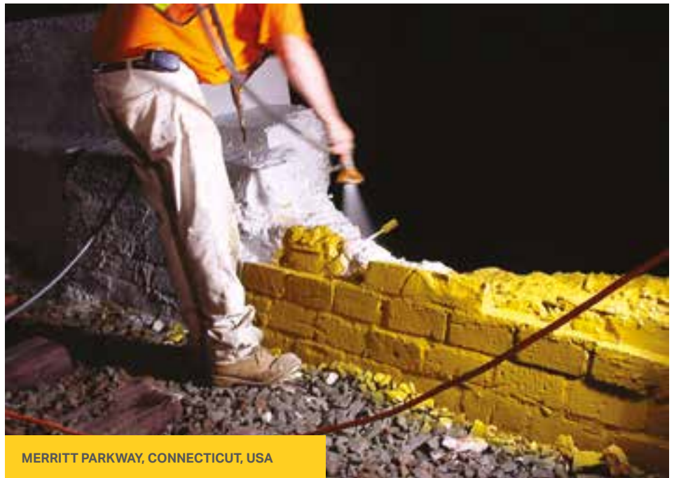
MERRITT PARKWAY, CONNECTICUT, USA

*Illustration not representative to scale or colour